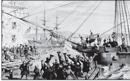
Lithograph by Nathaniel Currier— Public Domain

In retaliation for the Boston Tea Party (1773), the Crown imposed rigid limitations on the freedom of Massachusetts citizens.