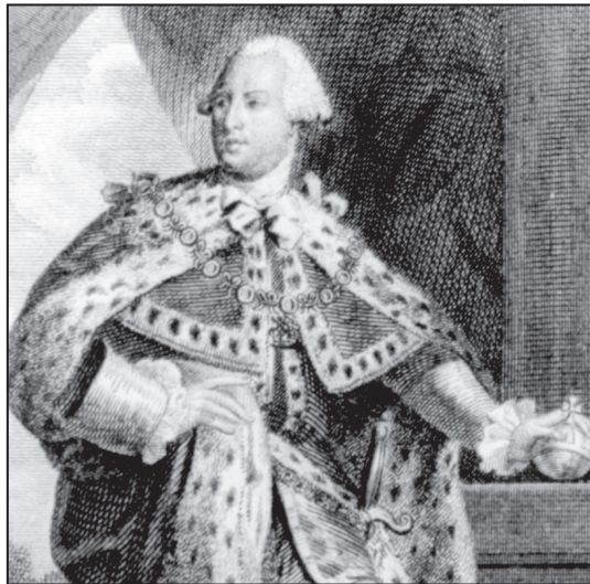
Oil by Allan Ramsay—Public Domain

1 AT PHILADELPHIA in the summer of 1776, the Delegates to the Continental Congress courageously signed a document declaring the Independence of the Thirteen American Colonies from Great Britain. Not only did the Declaration of Independence create a Nation, but it also pronounced timeless democratic principles. Enshrined today in the National Archives Building at Washington, D.C., it memorializes the founding of the United States and symbolizes the eternal freedom and dignity of Man.